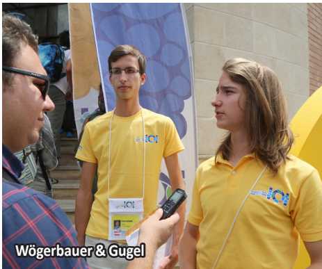
Wögerbauer & Gugel